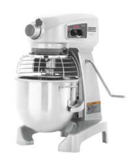
Model HL120 12 qt (11 l) bowl capacity