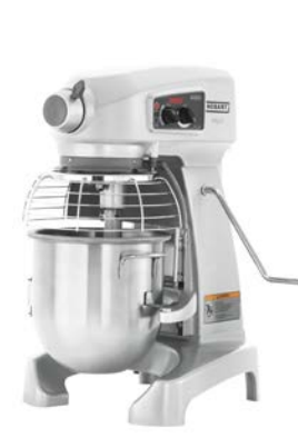
Model HL200 20 qt (19 l) bowl capacity