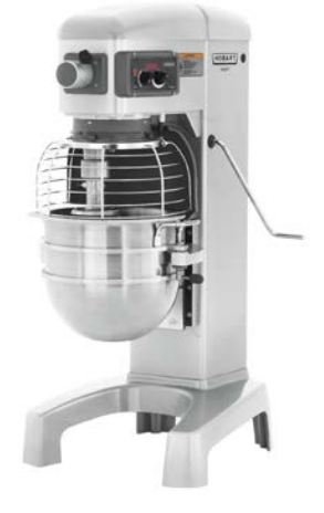
Model HL300 30 qt (28 l) bowl capacity