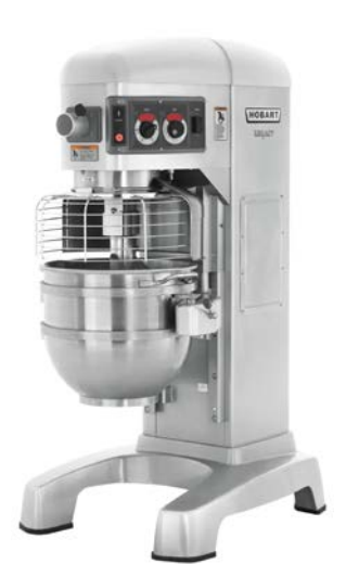
Model HL600 60 qt (57 l) bowl capacity