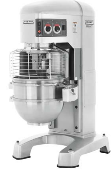
Model HL800 80 qt (76 l) bowl capacity