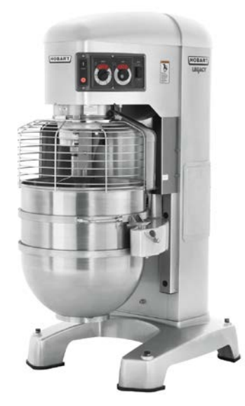
Model HL1400 140 qt (133 l) bowl capacity